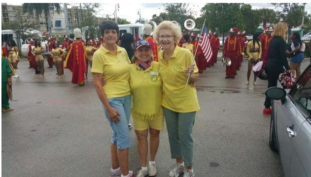
2017 MLK PARADE