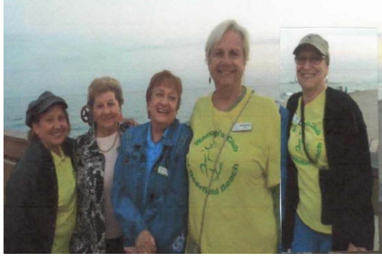
MEMBERS AT THE VIP FUNCTION