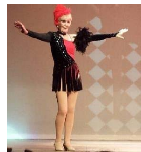
SOMETHING TO BE PROUD OF: